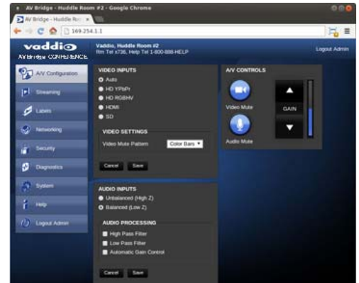
Web Page Example

Made in the USA: Vaddio both designed and manufactures the AV Bridge in Minnetonka, Minnesota.