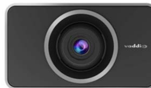
HD Camera Module