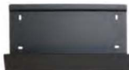
Wall Mount with Cable Tray