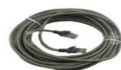
25' (7.62m) Cat-6 SSTP Cable (50' / 15.24m Available Accessory)